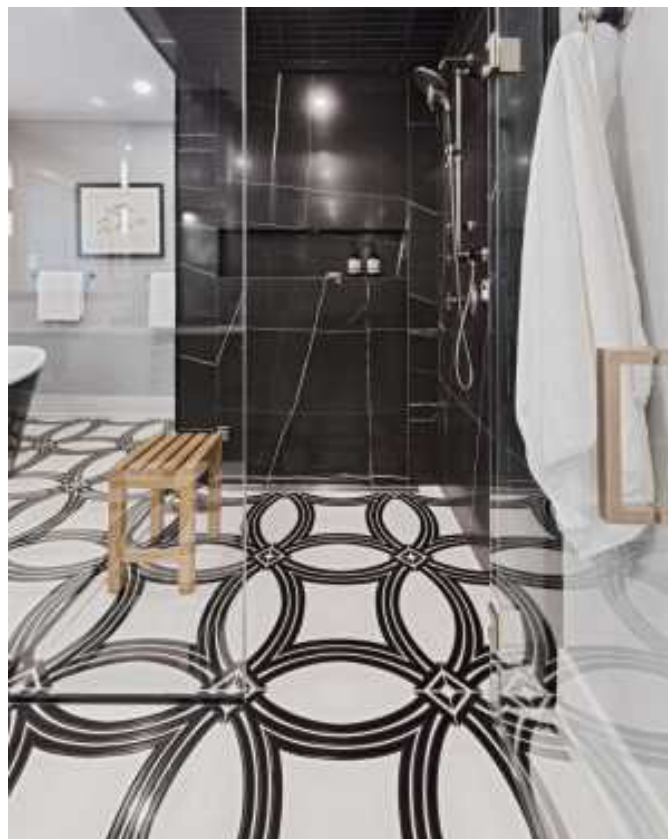
Porcelain slabs are a specialized product now available in Ottawa. They’re seen in this shower by Amsted Design-Build and StyleHaus Interiors.

And having all of these decisions made ahead of time means there is one less thing to have to remember once construction has begun.