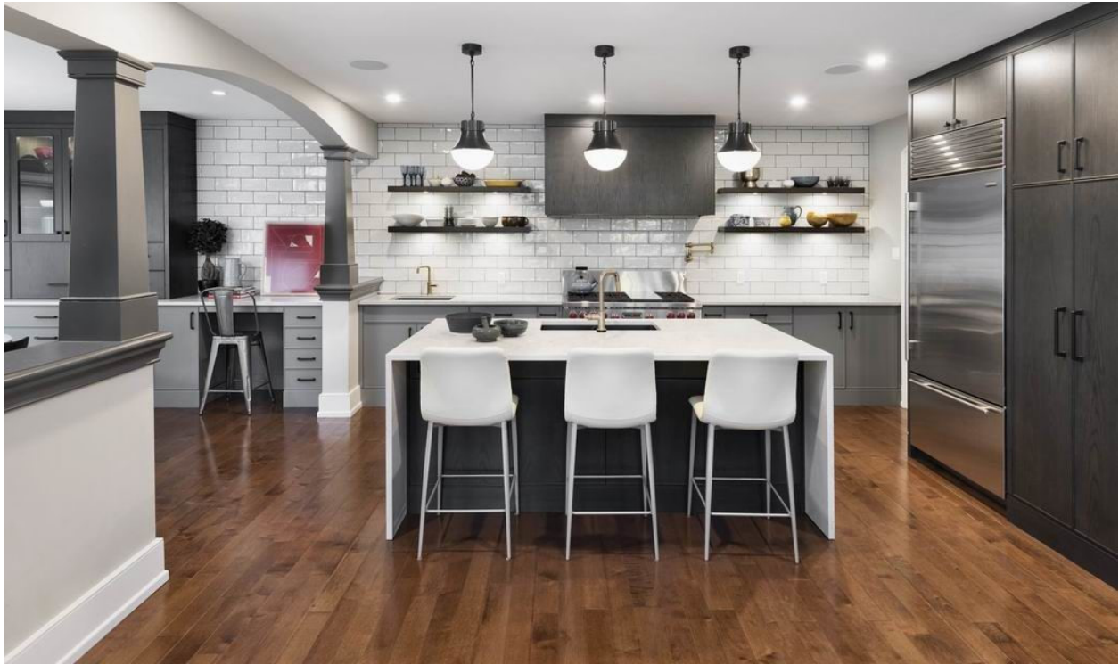
The cabinetry in this project had to be reconfigured when a hidden structural beam was discovered during demolition.