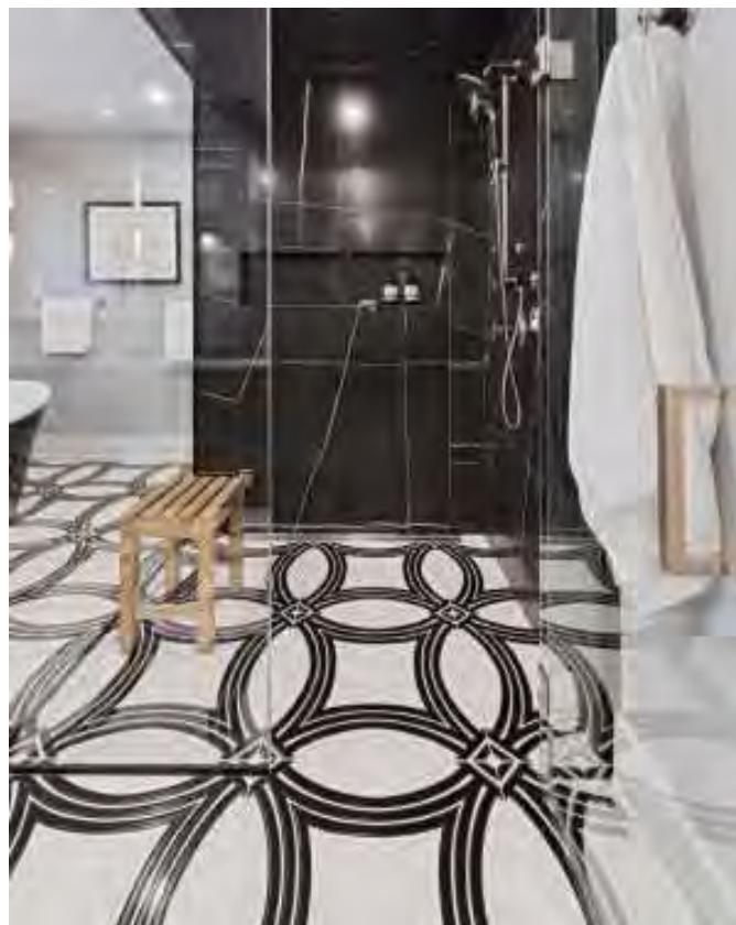
Porcelain slabs are a specialized product that’s newer in Ottawa. They’re seen in this shower by Amsted Design-Build and StyleHaus Interiors.

And having all of these decisions made ahead of time means there is one less thing to have to remember once construction has begun.