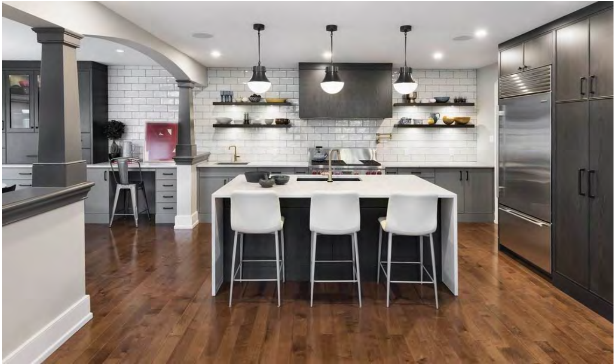
The cabinetry in this project had to be reconfigured when a hidden structural beam was discovered during demolition.